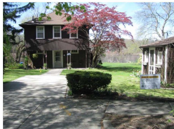
17 Malvern Terrace

The purpose of this memorandum is to provide the City Council and the public with technical information and planning analysis conducted by the Planning Department. The Planning Department's intention is to provide a balanced review of the proposed project based on information it has at the time of the public hearing. Additional information about the project may be presented at or after the public hearing for consideration at a subsequent working session by the Land Use Committee of the City Council.